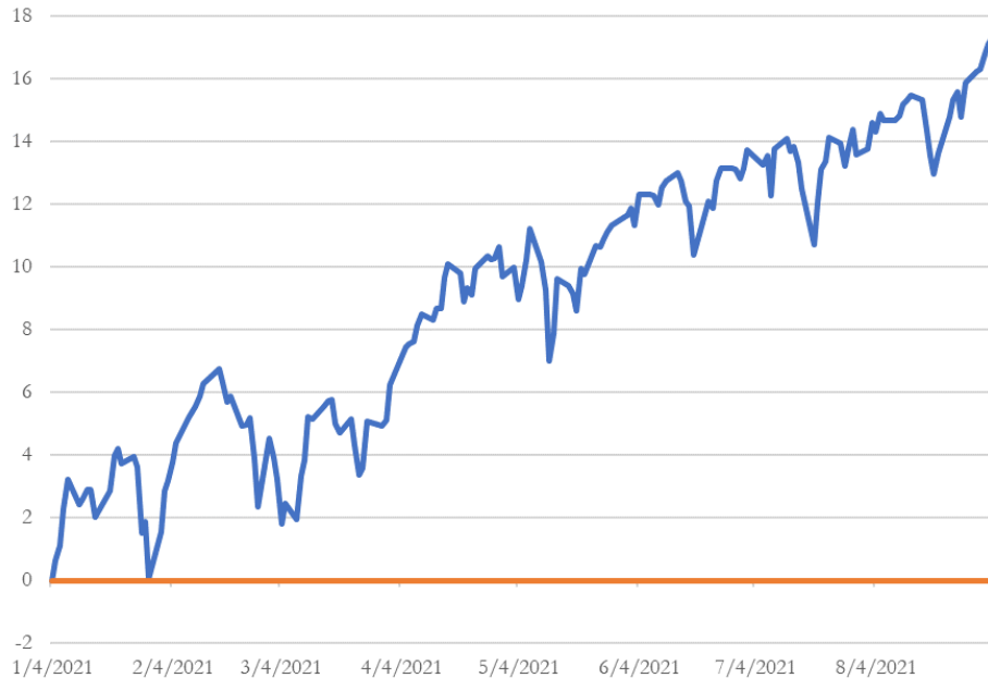
January - August